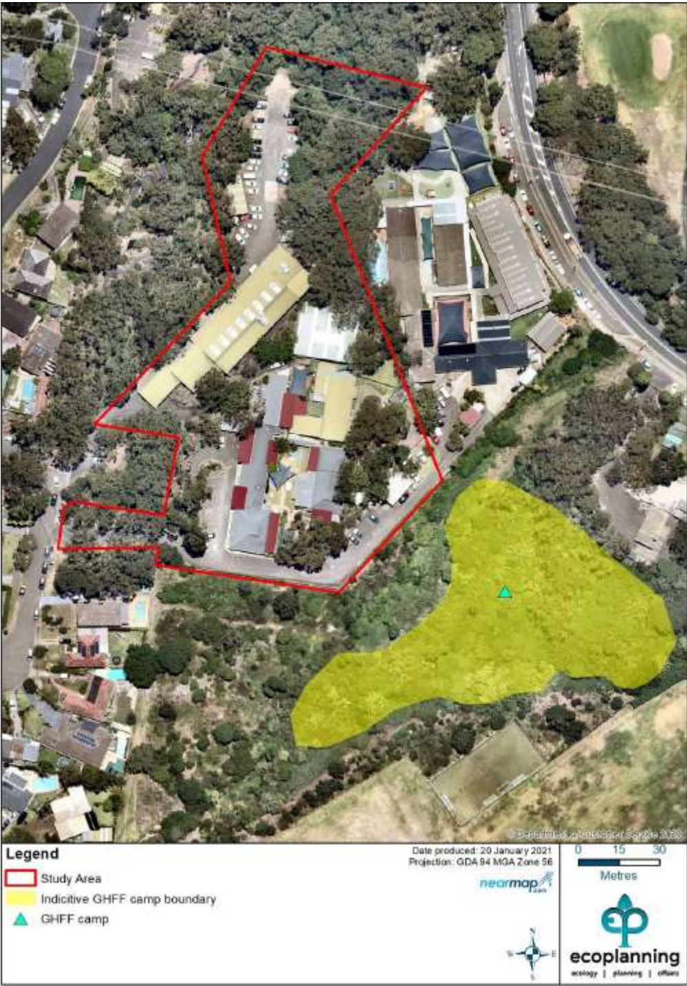
Figure 1 Location of study area and Grey-headed Flying-fox.